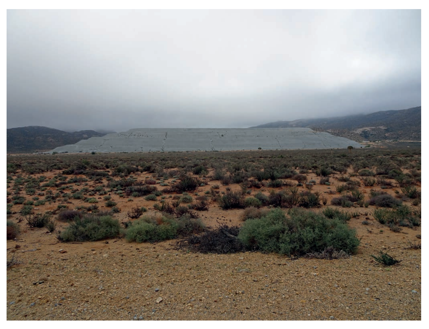
Fig. 4.2 for Question 4