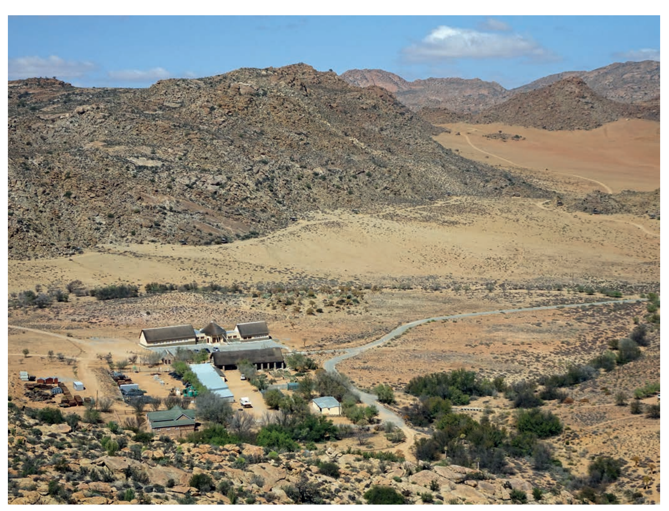
Fig. 4.1 for Question 4